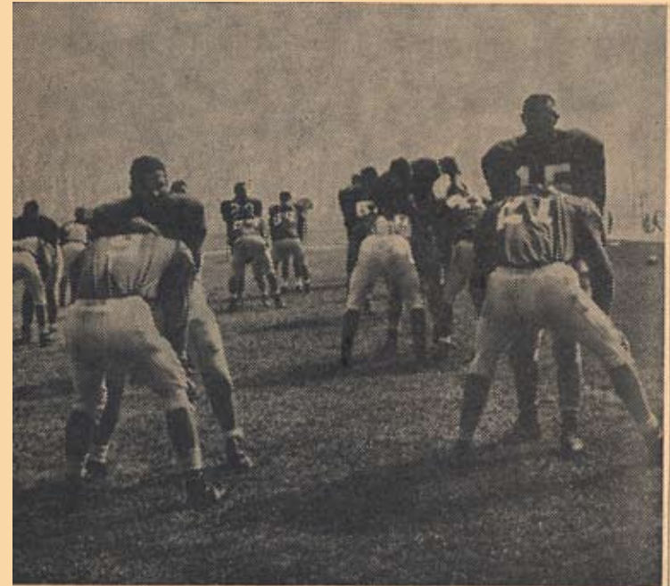
Varsity Eagles Strain For Top Conditioning To Face The Season Ahead.