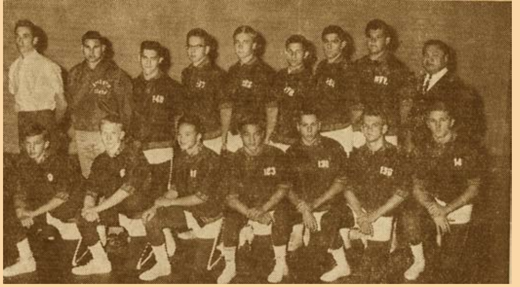
Wrestling Team Poses After A Championship Season

Future plans include a Muntz Stereo pack, E.T. Mags, Revmaster Tach, and a four-speed floor shift.