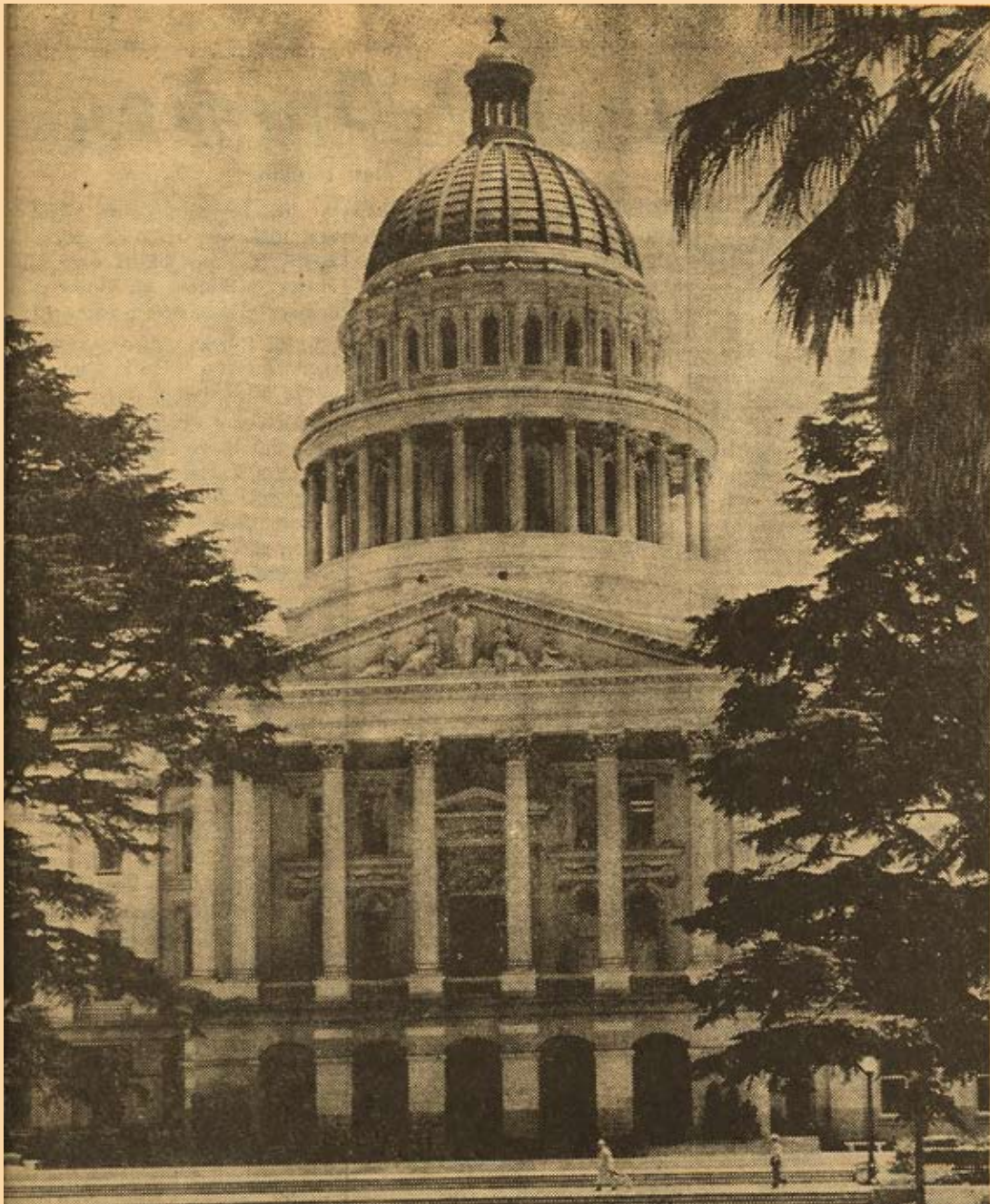
The California State Capitol Building as viewed from the main entrance. 43 EHS seniors visited the Capitol, (for the story see page 3).