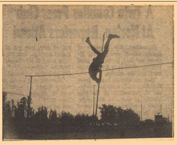
Bee Vaulter Clears Cross Bar Again.

North Rialto Shopping Center Mon.-Fri. 9:30 to 6:00 Closed Sunday