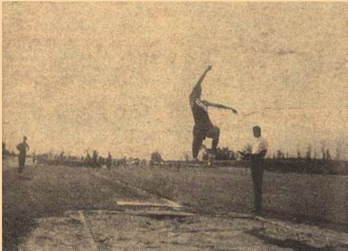
JOHN PITTS jumps to another victory