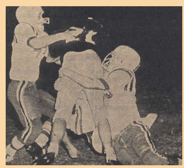
"I 'wanna' hold your hand!" shouts what's his face (?), No. 21, of No Gotta U, as he garciously judo chops two members of the opposing team.

effort. The team support at the games has been very good but not up to the highest level that it could be. It is true that our "home" games are clear over at Chaffey and that it is difficult for some people to get there, but if the team that plays football for you out there on the field is out every day after school practicing not be a difficult goal.