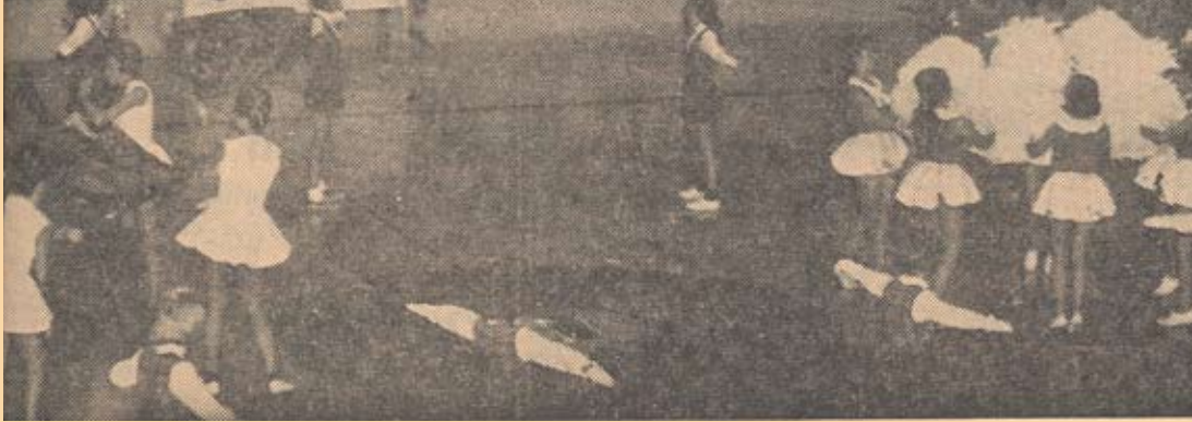
Pom Poms pom; Flag Twirlers twirl, and the Drill Team drills all together during last week's pep assembly for the San Gorgonio game.

The BEAT Tells You What's REALLY HAPPENING!