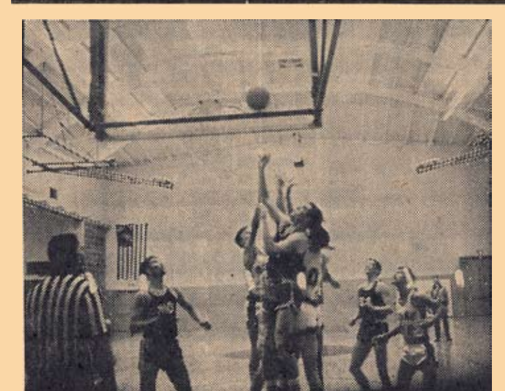
Please! One at a time!