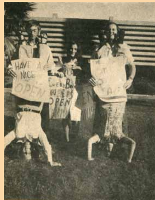
STUDENT COUNCIL members would even stand on their heads to keep open campus.

Members of student council have visited the "trouble spots" during both lunches and asked students to conform to school rules. According to reports, it is a small group of students who continue to defy school rules.