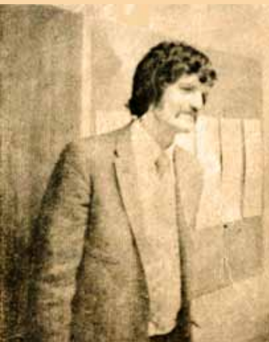
MR. MOELLER likes grasshopper pie!

Put in freezer at least one hour before serving.