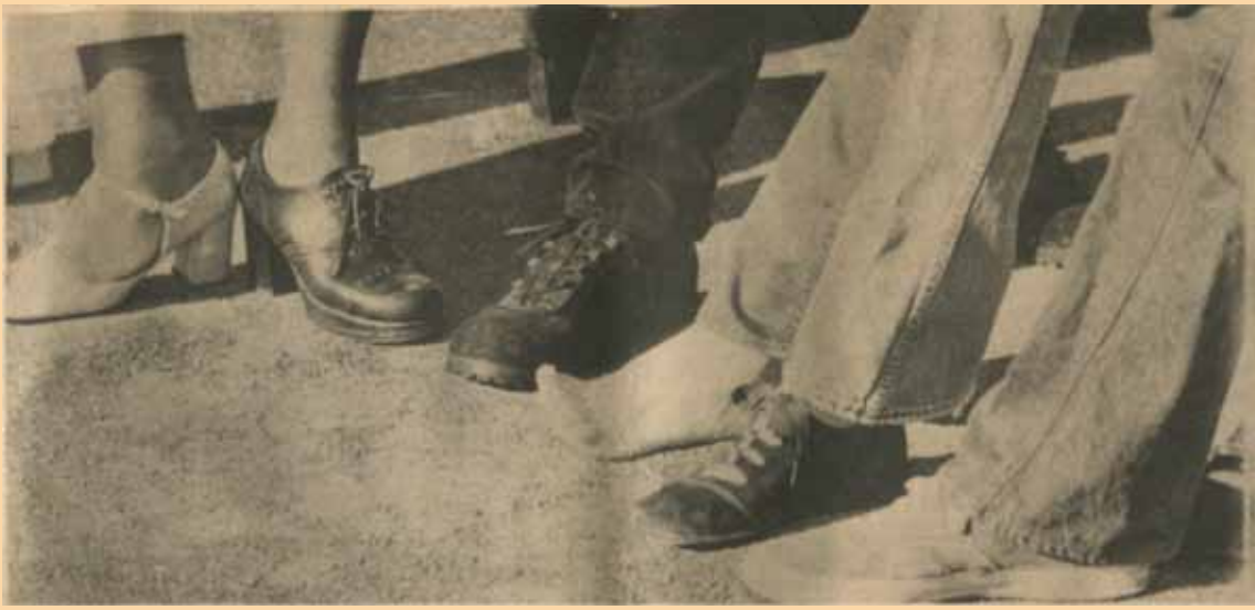
FEET PROVIDE outlet for creative, fashion-minded students. Everything from boots to barefeet can be observed almost any day of the week gliding over the immortal walkways of Eisenhower. One style does seem to be missing . . . high top tennies!

Both guys and girls seem to have a particular style in mind when they shop for shoes, rather