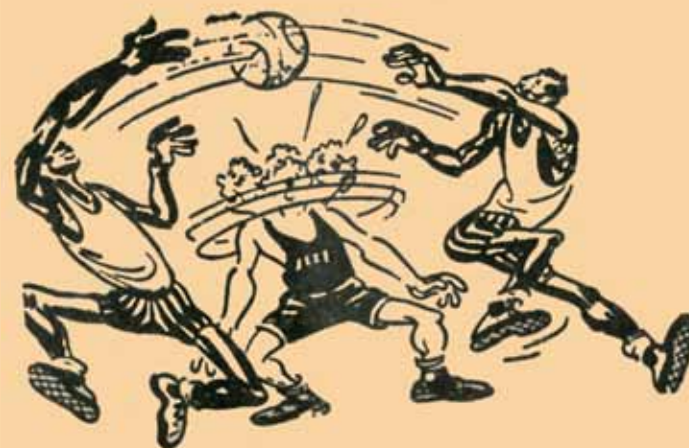
HARLEM CLOWNS return to Eisenhower to fascinate and awe spectators. Tickets will be sold at the door for $1.50 for all Ike students.